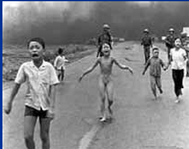
Vietnamese Girl Fleeing in Terror After a Napalm Attack , Nick Ut (Vietnam, 1972)